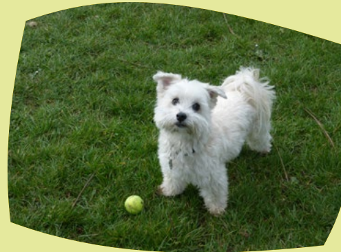
Playing with her ball