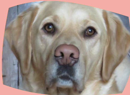
Being woken up

Just like people, dogs do not like to be woken up. If a dog is sleeping, leave them alone.