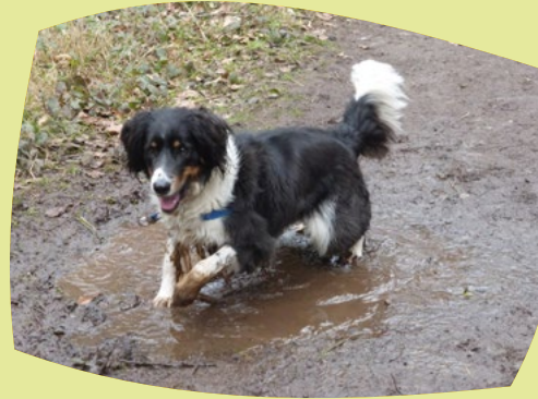
Splashing in mud