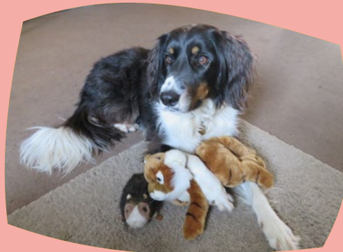
Things being taken away

Dogs do not like having things taken away from them. If a dog takes your toy, tell an adult.