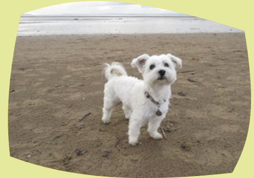
Walks on the beach