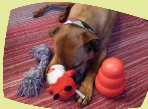
Playing with her toys