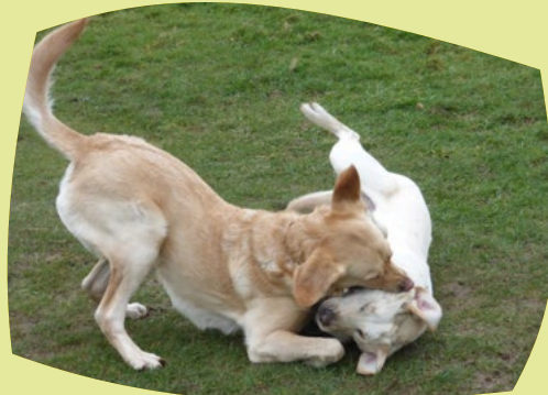
Playing with his friends