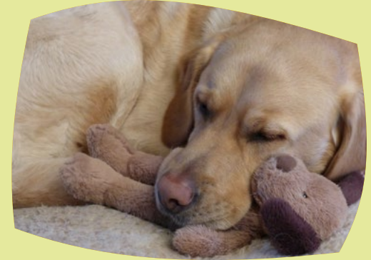
Sleeping with his teddy