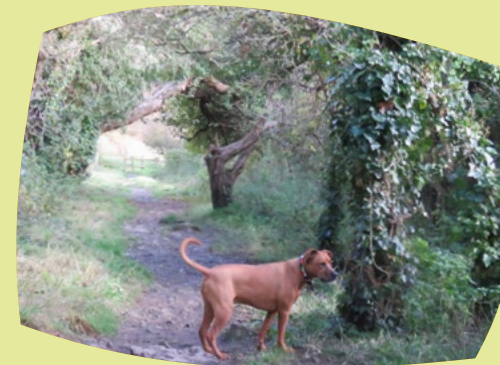
Walks in the woods