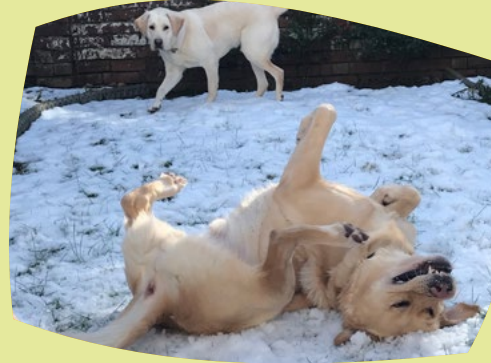
Rolling in the snow